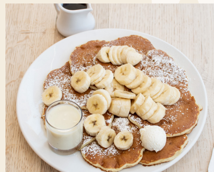
Banana Infused Bananas are baked in, then topped with banana-infused syrup... S 14 / F 16