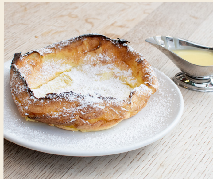
Mini Dutch Baby Fresh cream and egg, oven baked until light, airy and golden brown, served with fresh lemon butter glaze .....12