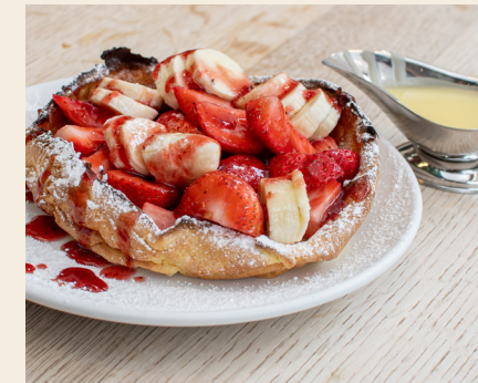
Strawberry Dutch Our mini dutch filled with fresh strawberries, bananas and strawberry sauce .....16