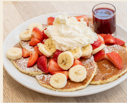
Fresh Fruit Buttermilk pancakes topped with seasonal fresh fruit (usually strawberries, bananas and blueberries) served with scratch strawberry syrup and whipped cream . S 16 / F 18