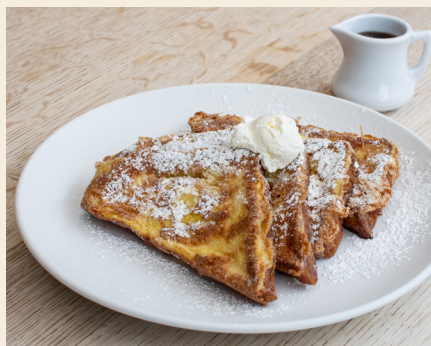
Challah French Toast Fresh baked Challah bread dipped in our vanilla infused cream batter, and then fried in butter .....12