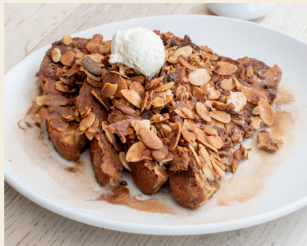
Cinnamon Almond Crunch French Toast Our challah french toast fried with cinnamon sugar and crunchy sliced almonds .....16