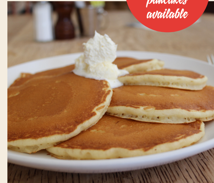
Buttermilk Hand mixed each morning—we haven't changed this recipe since 1953. ....12

Vegan & Gluten friendly pancakes available