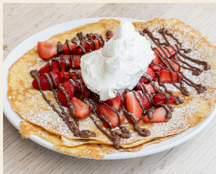
Strawberry Nutella Flapjacks Topped with fresh cut strawberries, warm nutella, and fresh whipped cream ..... 18