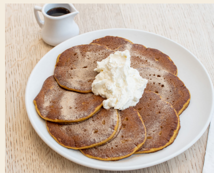
Pumpkin Pancakes This fall treat is dusted with cinnamon sugar and topped with whipped cream. If you like pumpkin pie try our pumpkin crepes ..... S 14 / F 16