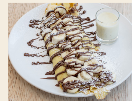
Banana Nutella French crepes, topped with bananas, warm nutella and served with banana infused syrup Add strawberries +4 .....16