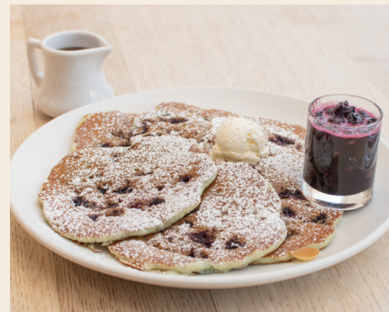
Baked Blueberry Blueberries baked in and served with real blueberry syrup ..... S 14 / F 16