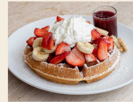
Strawberry Banana and Cream Waffle Our waffle topped with fresh cut strawberries, bananas, fresh whipped cream and served with strawberry syrup. .... 18