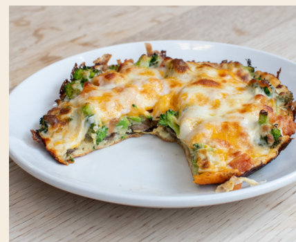
Dutch Garden Sweet and savory combined to make this delicious treat. Broccoli, mushrooms, and tomatoes baked in and topped with melted mozzarella and cheddar cheese .....16