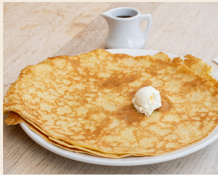
Classic 49er Flapjacks Thin and flat, looks like a crepe but tastes like a pancake .....14