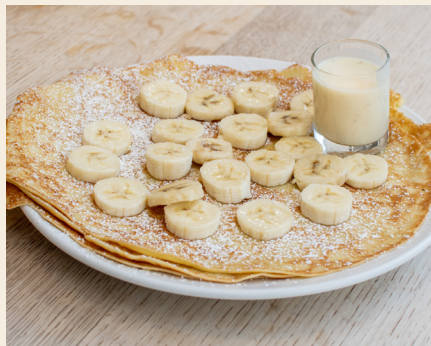
Banana Flapjacks Topped with bananas and our banana infused syrup .....16