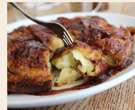
Apple Pancake The one and only! made with fresh cream and eggs, baked in the oven to make a sweet cinnamon sugar and Granny Smith apple glaze .....16