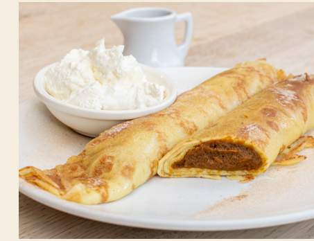
Pumpkin Pie French crepes filled with our pumpkin pie mix, topped with cinnamon sugar and served with fresh whipped cream .....16