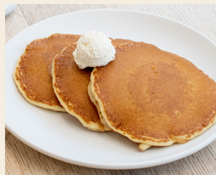
Short Stack Buttermilk Buttermilk short ..... 9