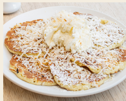
Toasted Coconut Cream Baked in and topped with freshly toasted coconut and topped with whipped cream ..... S 14 / F 16