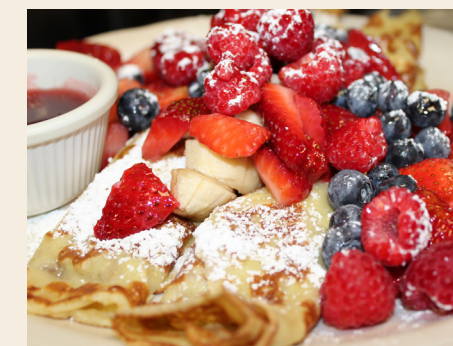
Fresh Fruit Seasonal fruit (usually strawberries, bananas and blueberries) on top of our french crepes and served with strawberry syrup ..... 18