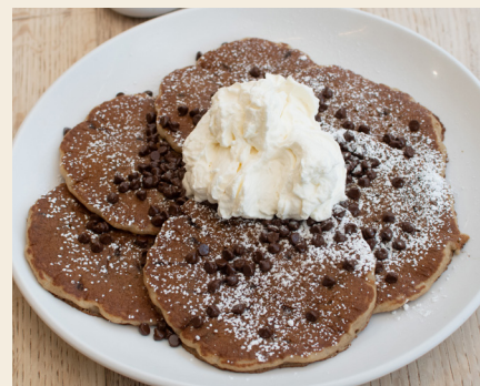
Chocolate Chip Lovers Infused with melted Hershey's chips topped with fresh whipped cream ..... S 14 / F 16